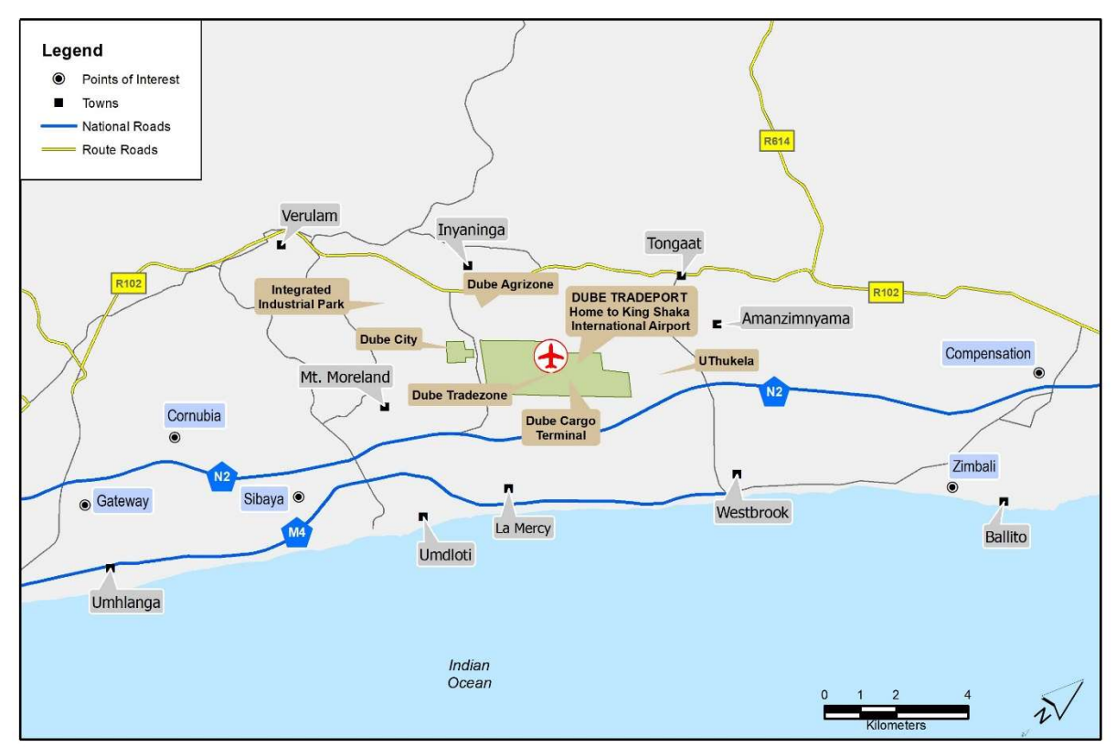
Figure 2: Inside the Fence spaces of the Durban Aerotropolis (illustration: Nomkhosi Luthuli).

Size-defined, fixed and bounded conceptualisations of scale are evident in Integrated Aerotropolis Strategy references to a footprint that requires differentiation between the airport city (a zone 'inside-the-fence') and the aerotropolis more broadly (the catchment area) (EDTEA, 2015). As explained earlier, the airport city form and function is characterised by commercial functions located on and immediately around the King Shaka International Airport site. The airside activity space includes shopping mall concepts merged into passenger terminals, retail (including streetscapes and upscale boutiques), restaurants (increasingly higher-end and themed), leisure (spas, fitness, recreation, cinemas and more) and culture (museums, regional art, musicians, chapels). On the landside are hotels and entertainment, office and retail complexes, convention and exhibition centres, time-sensitive goods processing facilities and industrial developments. These airside and landside activities are what is referred to as 'inside-the-fence' activities of the Durban Aerotropolis (see Figure 2).