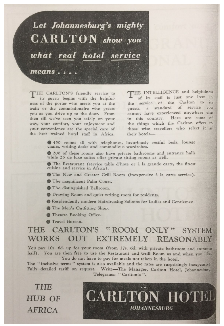
Figure 2: Carlton Hotel advertising 1939 (Source: South African Railways and Harbours, 1939).

The Carlton Hotel was an exceptional establishment in the Johannesburg hotelscape. Most Johannesburg hotels refracted the national problems in terms of limited quantity of international tourist facilities and existing establishments often exhibiting poor quality standards, especially of accommodation services, because of the economics of liquor domination. In 1944 the Chairman of the Johannesburg Publicity Association stated that the city's accommodation resources were "severely tried", a condition not assisted by the fact that the national government treated the hotel industry "as an outcast" (Rand Daily Mail, 27 October 1944). The poor levels of service offered in city hotels were flagged in speeches made by H.J. Crocker, the director of Johannesburg's publicity association. He stated in 1947 that "We must improve our manners, or, at least, learn to show a cheerful face to visitors" (cited in Vynne, 1947: 17). In 1950 widespread reports surfaced about conditions endured by tourists in the city's so-called 'best' hotels. From scathing comments made by both local and international visitors the following unpromising picture was painted.