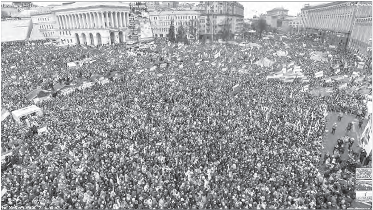
Figure 5: Independence Square, the Uprising of Dignity (Euromaidan) in Kyiv, 2014.

tories that were developed due to the construction of new subway stations – Amur Square ( Amurs'ka ploshcha ) and Holosiyiv Square ( Holosiyivs'ka ploshcha ) – as well as the exits from the Akademmistechko and Kharkiv ( Kharkivs'ka ) subway stations also have features of nodal areas. A number of Kyiv squares that were formed at the intersection of newly paved streets were not included in the list of existing nodal areas: Ankara Square ( Ploshcha Ankary ), Panteleimon Kulish Square ( Ploshcha Panteleymona Kulisha ), Kerch Square ( Kerchens'ka ploshcha ), Volgograd Square ( Volhobrats'ka ploshcha ), and Valeriy Marchenko Square ( Ploshcha Valeriya Marchenka ). Today, they only perform the function of road intersections and do not attract residents pursuing leisure activities. We assume that eventually these territories will acquire additional functions due to their transport accessibility. At the same time, and in the case of preserving current trends, the space of these areas is under threat of being transformed into a routine landscape of shopping centres, kiosks, and shops on wheels.