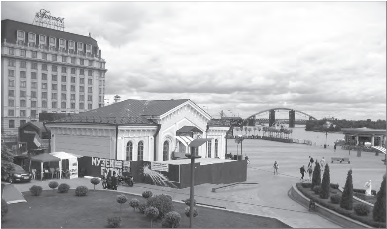
Figure 3: Postal Square, Kyiv, Ukraine. The sign on the fence reads "There will be a museum!".

processes described above, we next examine the current state and transformations of these three areas.