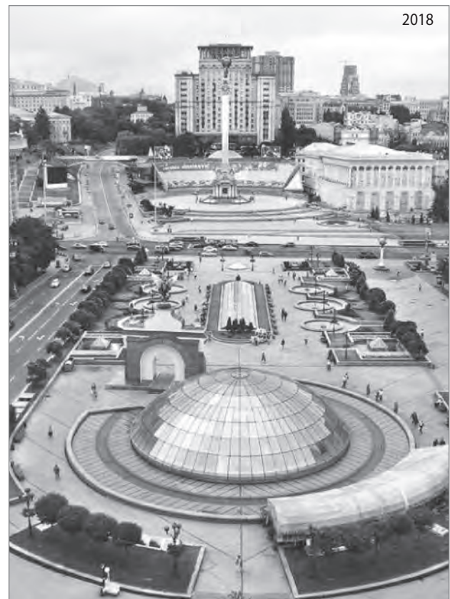
Figure 4: Independence Square: before and after the 2001 reconstruction.

site of the river station and underground (note the dominance of economic priorities), the area now faces enormous problems with the need for more parking spaces.