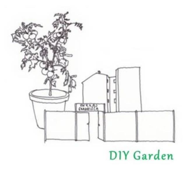
Figure 4: Graphics used in the website public appeal for creating Beyond the Construction Site (adapted from source: Internet 4).

(new job opportunity); the facilitated self-governance approach taken at BCS therefore increases their knowledge in this regard.