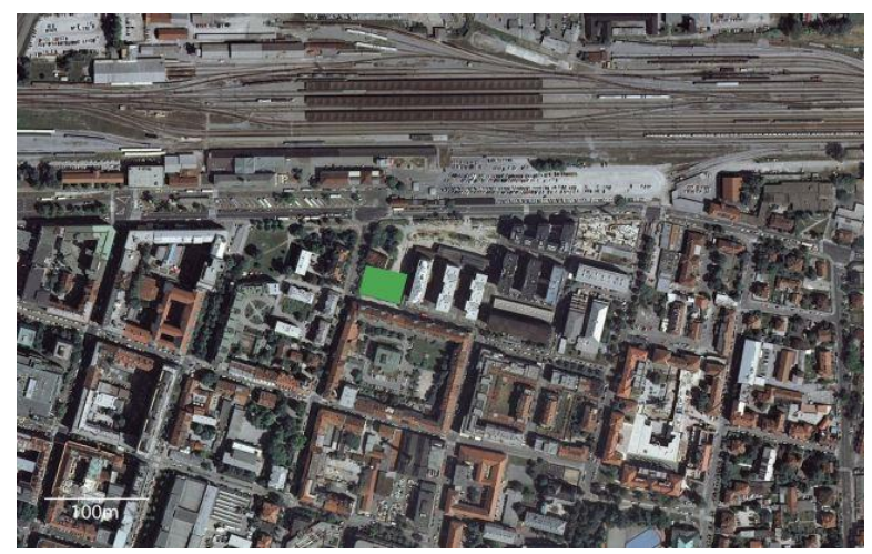
Figure 3: Location of BCS in Ljubljana