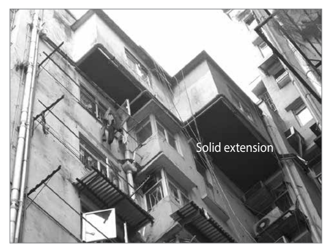
Figure 2: Solid extension.