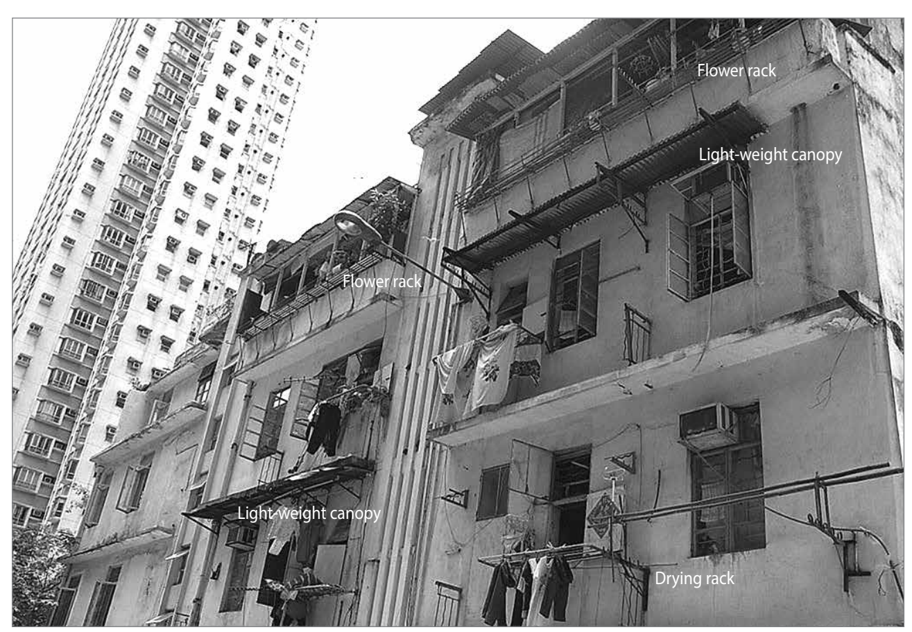
Figure 1: Lightweight canopies, flower racks and drying rack.