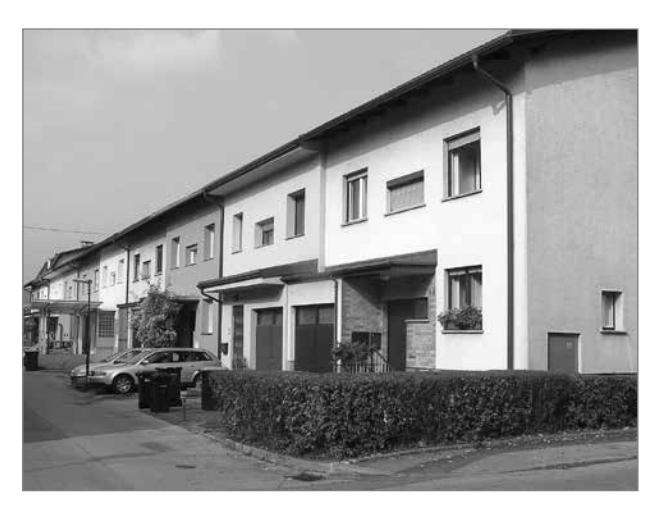
Figure 4: Persons with a higher level of positive and stable self-esteem (i.e., internal self-esteem) have more positive and clear expectations with regard to purchasing real estate.

about the setting of the hypothetical model of psychological factors in the decision to buy real estate, which integrally and relationally clarifies the role of psychological characteristics of real estate buyers in their expectations regarding the decision to buy. In our model, these are basic and status motives, subjective emotional wellbeing and self-esteem.