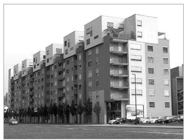
Figure 3: People with a higher level of satisfied needs are more satisfied with their real estate or have clearer and more positive expectations with regard to their purchase.

of the two groups of factors in the decision to buy real estate, the real estate itself and the psychological factors.