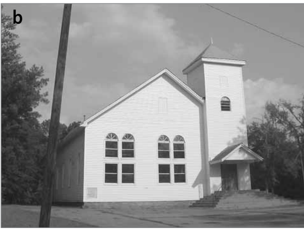
Figure 3: a) Shiloh Methodist Baptist Cemetery, Notasulga. This cemetery epitomizes the rural African-American cemetery in Alabama; b) The Shiloh Methodist Baptist Church is home of the Methodist Baptist African-American community in the rural village of Notasulga (a: source: Google Maps, 2013; b: photo: Marco Giliberti).

However, government policies such as that establishing the bioethics centre on the Tuskegee campus have been criticised in recent years. Sims (2009) argued that the institutional response did not satisfy community expectations. She argued that the African-American community of Notasulga had always considered the neighbouring Tuskegee University to be a place apart, historically, culturally and morally segregated from the community of Notasulga (Ware, 2011). Instead of the Bioethics University Facility, Sims valued a tree planted close to the Shiloh Rosenwald School in rural Macon County. This tree, Sims says, is a symbol that is able to perpetuate the