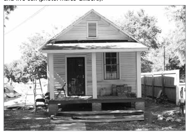
Figure 7: The new Safe House Black Historic Museum in Hale County, in southeast Alabama. The museum is dedicated to the memory of Martin Luther King, Jr..

the 1960s. Selma's Department of Historic Preservation prescribed that the memorials in the area (especially the National Voting Rights Museum and Institute established in 1993, the Slavery & Civil War Museum established in 2002 and the Jeff Reeb Memorial Sidewalk established in 2005) be developed together with a restoration project for Saint James's Hotel and restoration of the old urban commercial axis of Water Avenue in Selma's downtown historic district. Planners and administrators adopted preservation strategies, hoping to attract tourism to the town. In Selma, however, the old African-American cemetery is the main memorial (Figure 6).