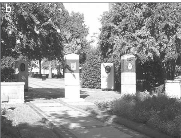
Figure 9: a) A sculpture in Kelly Ingram Civil Rights Memorial Park, (Birmingham Civil Rights District); b) Entrace to Kelly Ingram Civil Rights Memorial Park.

paternalism fuelled the underclass' political and economic optimism. However, urban Alabama slowly and constantly declined in the second half of the twentieth century. Both politicians and administrators failed to curb urban physical decay and racial tensions. In the second half of the twentieth century, the growth of the civil rights movement and its rapid spread forced designers to face new challenges and work on new disciplinary paradigms, which can operate in a rapidly changing society (King, 1958). The emerging socio-political scenario represented an opportunity for experimentation in design (Sandage, 1993; Blair & Neil, 2000; Assmann, 2011). The theme of the memorial highlighted the need for research (Blair & Neil, 2000). Because the city of Montgomery occupies a fundamental place in the collective memory of the civil rights struggles of the 1950s and 1960s and at the end of the twentieth century, the Civil Rights Memorial in Montgomery became the new paradigm for memorial design (Connerly, 2005; Boyer, 2011). The new frontier of the memorial landscape of African-Americans is Mobile. It is the oldest among the harbours facing the Gulf of Mexico, and it was a