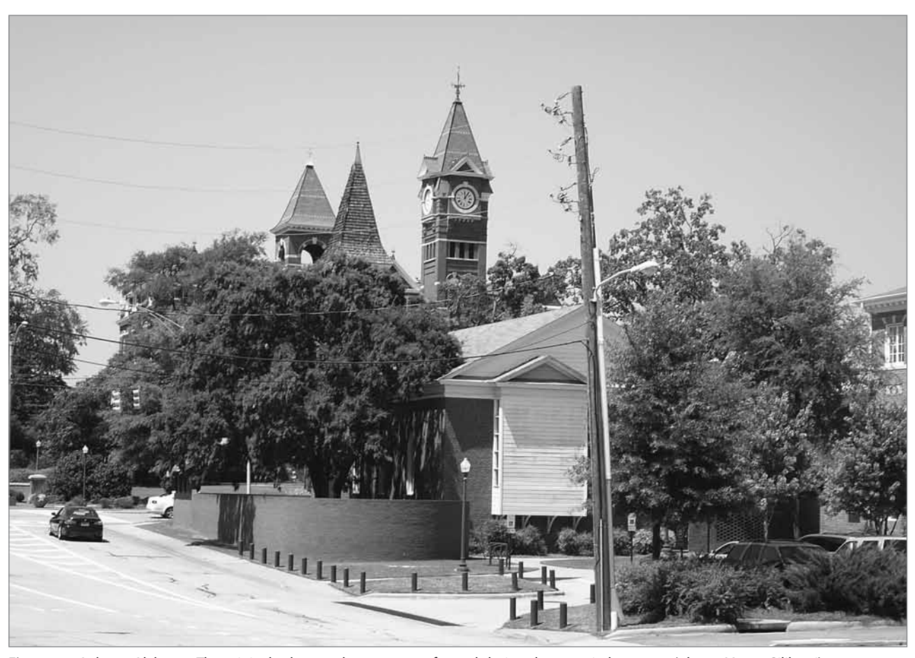
Figure 19: Auburn, Alabama. The original urban nucleus was transformed during the twentieth century.

local administrators consider African-American heritage a factor that can boost local tourism in eastern rural Alabama. The LCIC is also an indicator of an emerging phenomenon. The practice of planning for African-American history is involving new strategies. Specifically, the practice of memorializing a historical event "where it was, as it was" has been gaining popularity among planners in recent decades. The memorial should preferably be placed within the landscape where the historic event occurred. Planners believe that following this principle is sufficient to serve the African-American community. This practice has created some advantages. A memorial such as the LCIC has powerful symbolic value for old civil rights activists. On the other hand, there is the risk of the planner creating an isolated site for African-Americans. Although this is not what always happens, there is a risk that this typology of museums (due to their location in a remote rural town) can fail the planners' aims. Who are such museums intended for? This observation leads the planner toward a general conclusion. The practice of planning for African-American history is based on a complex set of operations that requires combined efforts from different types of communities, institutions and agencies.