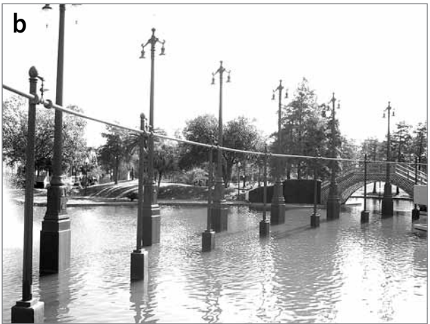
Figure 14: a) Louis Armstrong Park, New Orleans. Main entrance; b) Louis Armstrong Park introduces some elements of the traditional English landscape into New Orleans' urban setting.

was established close to the slave market and the railway, is now reduced to a few physical fragments. The old physical connection between the slave market and the railway has recently been broken. Such developments raise the following questions: How should one conceptualise a new type of museum for celebrating African-American history in the southeastern United States? How can one better use, imagine, plan and re-design buildings and spaces of African-American history? How can the severely damaged places of African-American history be restored and rehabilitated?