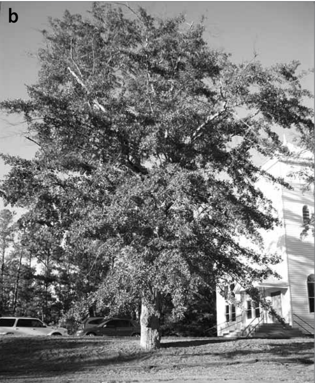
Figure 4: a) The Shiloh Methodist Baptist Cemetery, where the largest number of victims of the syphilis study are now buried. The majority of victims were from Notasulga; b) This tree is a symbol of collective memory of the Tuskegee syphilis study. The tree marks where patients with syphilis stood waiting for treatment.