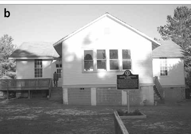
Figure 2: a) Interior of a Rosenwald school at Notasulga, Alabama. Original school desks (front), blackboard and stage (back); b) A Rosenwald school built in rural Notasulga, Macon County, Alabama. View of the restored facade.