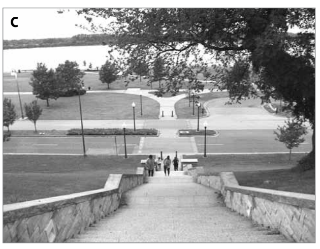
Figure 18: Memphis. a) The old riverbank was transformed in the years following 2000; b) The original urban railways join up at the backyard of a luxury real estate complex. This railway historically connects port and plantation; c) Steps connects luxury real estate and the part of the riverbank where the old port was.

relationship between the history of the civil rights movement and African-American history. Built close to U.S. Route 80, the Interpretative Center is now part of the SEMO. Tourist guides mark this place as the site of the tent city. Both the site of the tent city and the LCIC are destinations for school groups, scholars, historians and activists. A bus line links the sites and the LCIC to nearby cities. Currently, planners and