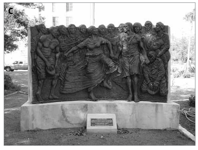
Figure 15: a) Congo Square is the familiar name for an urban land-scape in the southern part of Louis Armstrong Memorial Park in New Orleans; b) Saint Louis Cemetery No. 1 is part of a whole that finds its raison d'être in New Orleans' grid; c) African-Americans Dancing and Singing the Bamboula , by Adewale Adenle. The sculpture is in Congo Square Park, New Orleans.

period of urban renewal. In 2005, a Civil Rights Center was established in close proximity to the memorial. In 2010, the Southern Poverty Law Center was established, which now dominates the view of the capitol building from the memorial. Observing the distinct physical and symbolic relation of the memorial and the street reveals that the multifaceted arithmetic associations of the master plan were calculated to create