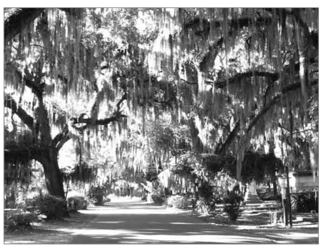
Figure 6: Selma's historic cemetery. Spanish moss is a blossoming parasite that often grows on large southern trees such as cypress and live oak.

Dallas County historically held a strategic spatial position in the regional river-based cotton trade and was a notable place in civil rights history during the march from Selma to Montgomery in 1965. The town of Selma is located in Dallas County on the banks of the Alabama River and is the site of the Edmund Pettus Bridge, where a key moment in the African-American struggle for voting rights occurred in