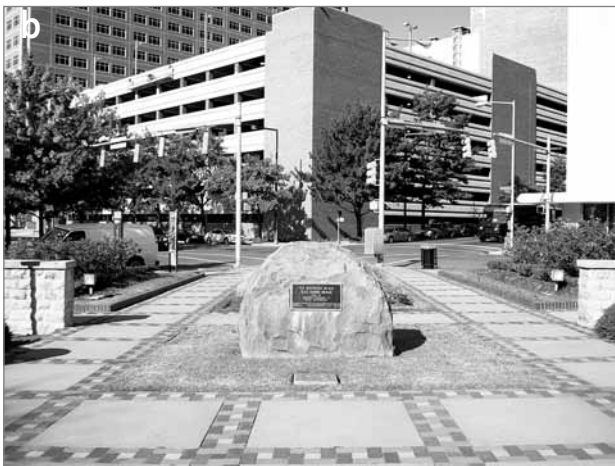
Figure 8: a) Birmingham Civil Rights Institute (Birmingham Civil Rights District). The district includes the Alabama Jazz Hall of Fame and the 16th Street Baptist Church; b) Kelly Ingram Civil Rights Memorial Park (Birmingham Civil Rights District). Interior view.

accomplished in this case. King was in peril when he found this shelter to escape the persecution of the Ku Klux Klan. There is a symbolic representation of temporal suspension and uncertainty, such as what King experienced during his stay in Greensboro in 1968. However, in this case the planners adopted hagiographic rhetoric. This rhetoric helps strengthen the already grand emotional connection that the visitor experiences at such a place. However, the museum finds its raison d'être in its rural surroundings, which are inhabited by low-income African-American families. The cases of Macon, Hale and Dallas counties epitomise the African-American memorial landscape in the Alabama countryside.