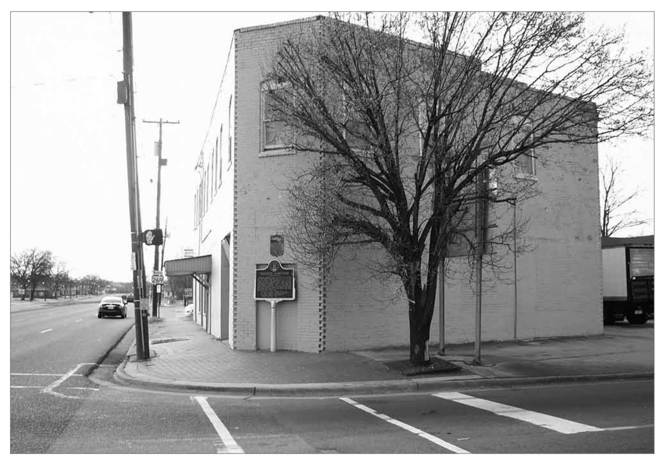
Figure 10: Tuxedo Junction: An African-American historic locality in the suburb of Bessemer in the Birmingham Metropolitan Area.

Tuxedo Junction is a few miles from Kelly Ingram Civil Rights Memorial Park. This is an African-American historic locality in the suburb of Bessemer. In the 1920s, at night, at the intersection of Twentieth Street and Ensley Avenue, the life of the African-American community flourished, nourished by the sophisticated icon of jazz. On the second floor of the music hall, located in a triangular red brick building (Figure 10), Birmingham's native son Erskine Hawkins led a unique, vibrant, musical scene. Jazz music started becoming a distinctive mark and a part of the Tuxedo name. A point of pride for those committed to the musical re-vitalisation of the city, the song "Tuxedo Junction", performed by Glenn Miller and written by Hawkins, was very popular in 1939 (Connerly, 2005). Currently, Tuxedo Junction is one of Birmingham's historic landmarks. The building still stands where it was sixty years ago. A sign marks the building's historic value. From the intersection, from the right distance, it is possible to appreciate the singularity of this historic remnant that appears alienated