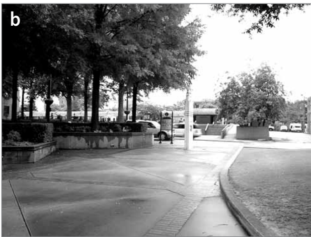
Figure 17: a) North side of Ebenezer Baptist Church. Martin Luther King, Jr., National Historic Site. View from the entrance street; b) Martin Luther King, Jr., National Historic Site. Interior view. The Metropolitan Atlanta Rapid Transit Authority (MARTA) connects it to the cultural center of the city.

houses (known as shotgun houses) are now lived in by both students and African-American low-income householders (Alderman, 2003). Together with tourists, students from the Atlanta university system have helped diversify a neighbourhood that is otherwise essentially African-American. Unfortunately, this study did not more thoroughly investigate the interaction between planning and the politics of memory. More research is needed in these directions. However, in 1996 the U.S. Congress recognized the fifty-four-mile Selma to Montgomery National Historic Trail (SEMO), which celebrates the course of the 1965 Voting Rights March in Alabama and the actions and citizens involved in it.