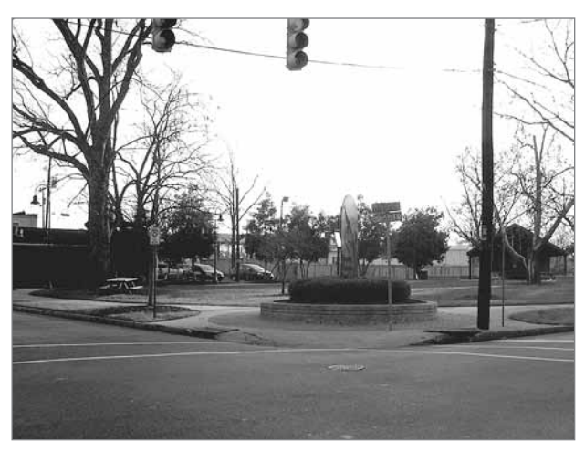
Figure 16: A metallic silhouette commemorating jazz composer Erskine Hawkins. The memorial is in the renewed historical African-America neighborhood of Tuxedo in Bessemer (photo: Marco Giliberti).

period of urban renewal. In 2005, a Civil Rights Center was established in close proximity to the memorial. In 2010, the Southern Poverty Law Center was established, which now dominates the view of the capitol building from the memorial. Observing the distinct physical and symbolic relation of the memorial and the street reveals that the multifaceted arithmetic associations of the master plan were calculated to create