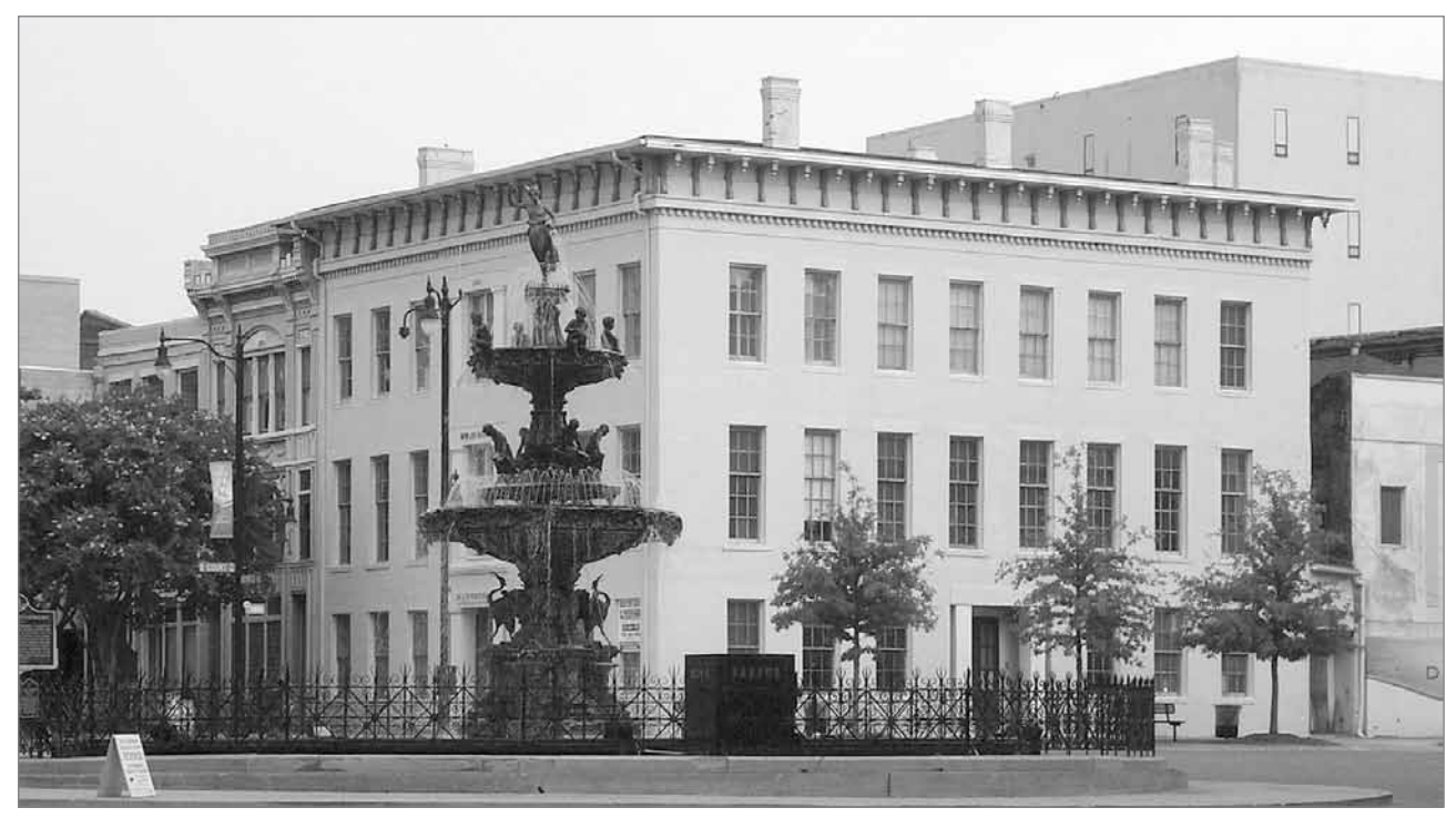
Figure 13: After decades of modification, a space historically used for selling and trading slaves has been remodeled to be the main square in Montgomery (photo: Marco Giliberti).