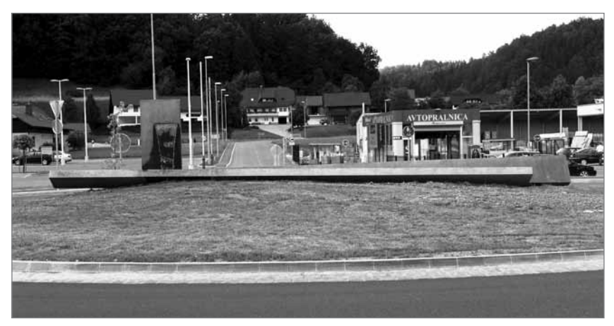
Figure 3: Water and stone motif.

At the entry junction arriving from the direction of Celje, the sculpture imitates the typical silhouette of the town of Mozirje, with its dominant church tower that follows the extension of the axis of the main street. The pillar of the sculpture is a metaphor for the church tower. Both street lines are formed by the attached buildings. The wide space between them allows views, both onto the facades and also onto the sloped rooftops. The horizontal elements, which are fixed at an angle and which try to represent that feature of the street view with some form of abstract interpretation. As the design of the coat-of-arms of Mozirje county is also linked to this motive, and the sculpture is at the same time its stylisation.