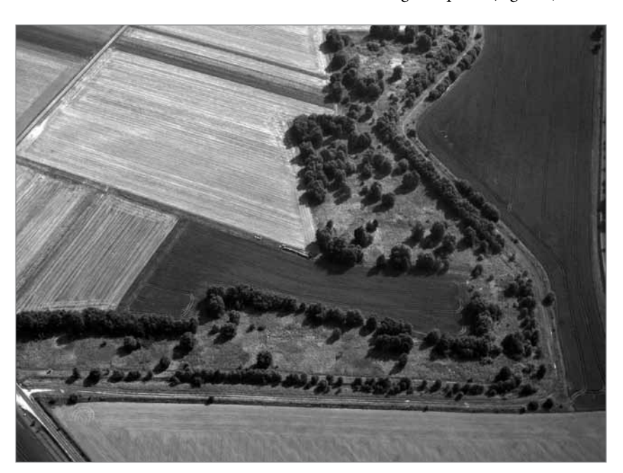
Figure 1: The Green Belt Germany (Thuringia/Hessen) in the valley of the river Werra. The Green Belt is often the last remaining habitat structure in agriculturally intensively used areas.

longest ecological network in Germany, extending 1,393 kilometres. By decree, it became a part of the national natural heritage in the coalition agreement of 2005 and as lighthouse project for the conservation of biological diversity in the National Strategy of 2008, the high status priority of the Green Belt for nature conservation in Germany has now been confirmed. It connects valuable areas, passing 17 distinct physiographical regions with more than 600 endangered species (Figure 1).