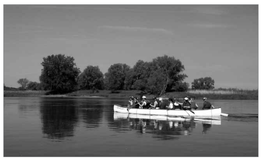
Figure 3: To paddle on the river Elbe, the former border river is one of the attractions of the model region of 'Elbe-Altmark-Wendland'.