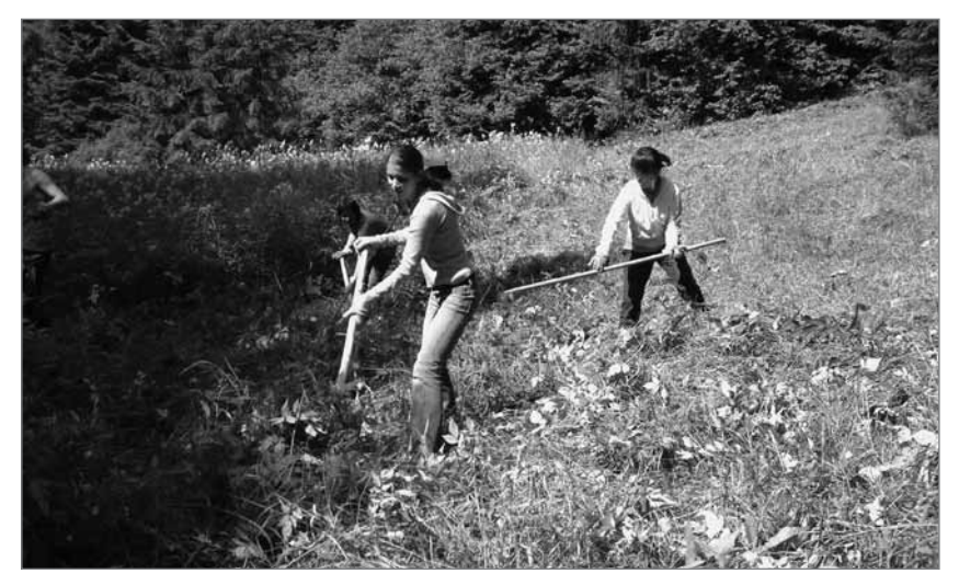
Figure 5: Young people can experience the nature of the Green Belt and the history of the Iron Curtain within a Youth Work Camp. One part of these camps is also outdoor work, to nurse these valuable habitats within the Green Belt.

E-mail: greenbelt@bund-naturschutz.de Internet: www.experiencegreenbelt.de