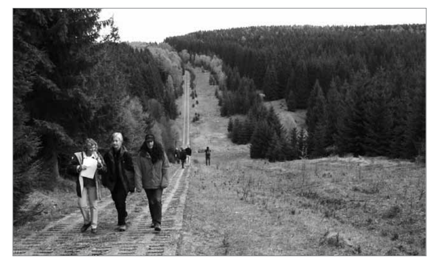
Figure 4: Hikers on the former border patrol path near Sorge in the Harz Mountains, a part of the Harz border path that runs for more than 100 kilometres along the Green Belt.

In the middle of the National Park in the Altenau district of Torfhaus over 800 metres above sea level, is the new visitor centre for the National Park. With an exciting exhibition and atmospheric multimedia resources, the 'TorfHaus' communicates the core philosophy of the National Park, of 'letting nature be nature', and informs visitors about the ecology of the natural resources and also